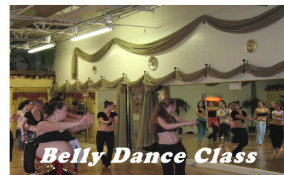
Belly Dance Class